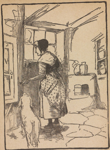
MOTHER HUBBARD AND HER DOG.